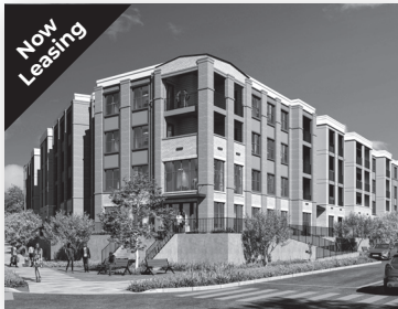
Gateway Oak Cliff Affordable housing for working families