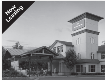
St. Jude Center-Vantage Point Permanent supportive housing for the homeless