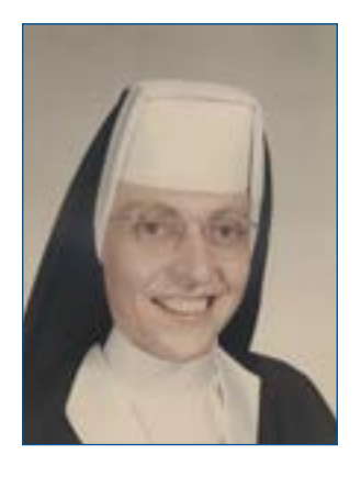
To make a memorial gift, please visit our secure online donation page www.ssndcentralpacific.org/donate