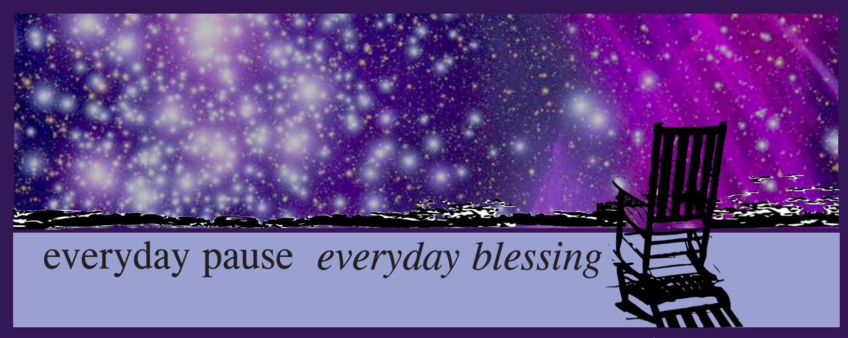
Third Sunday of Lent, March 19, 2017