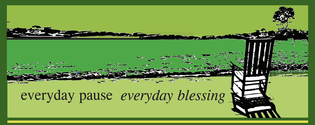
FEAST OF ALL SAINTS; November 1, 2016