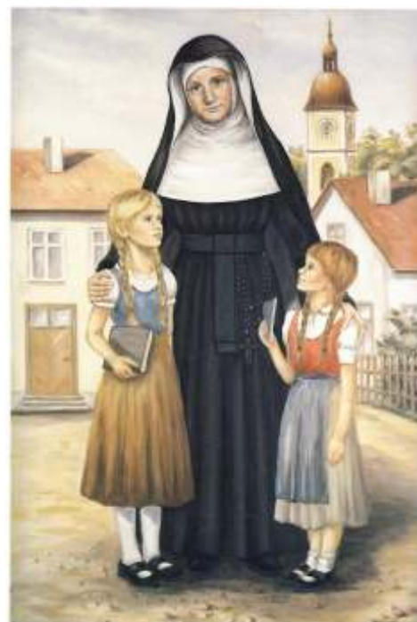
Image of our founder used at her beatification ceremony.

Our prayer is that each of us may be people of peace, hope, and love. For we all have been called and we all are sent.